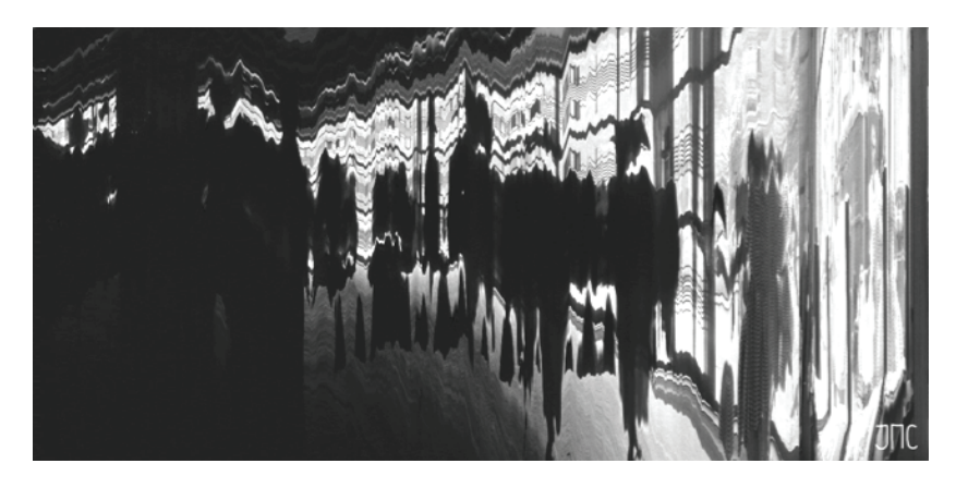
Fig. 3. "Time trace" "Femme en noir" extracted from the spatio-temporal cut of the movie "à bout de souffle" by J.L. Godard.

The Labofactory installation "Wave" proposes a different universe, where electronic music is played live and composed to include infrasound that, since it is not audible, is rendered on the surface of a shallow water tank installed flush at the top of three 3m long black steles. Shallow water waves behave like sound and unfold time into space. A light projector underneath the water immerses